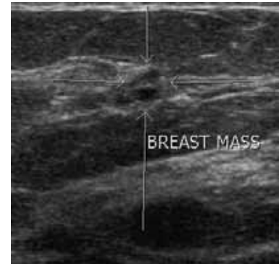
The breast lump

The offices of Zilkha Radiology are conveniently located next to major parkways. The offices are open from 7 a.m. to 8 p.m. Monday through Friday. On Saturday, the office hours are from 7 a.m. to 3 p.m. Call 631-277-1600 or visit zilkharadiology.com